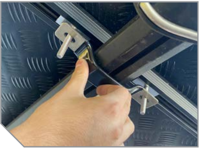
EASY TO USE MOUNTING BRACKETS