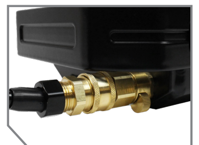
QUICK CONNECT FITTINGS