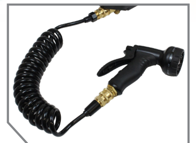
NOZZLE WITH MULTIPLE SETTINGS

The 4 Gallon Aluminum shower tank by Overland Vehicle Systems is a versatile and durable solution for off-grid adventures, providing you with a reliable source of water on the go. Featuring an adjustable shower hose and pressure relief valve, it ensures efficient and safe water flow, whether you're using it for a quick rinse or a full shower after a day of exploring. This shower tank is designed for overlanders and outdoor enthusiasts who value convenience and rugged performance.