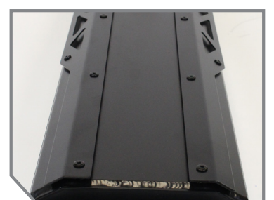
BLACK POWDER COAT