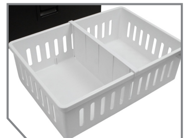
24 QUART REMOVABLE ORGANIZER