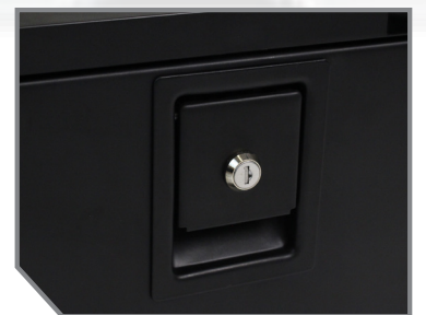
KEYED ALIKE LOCK LATCHES

Welcome to the Overland Vehicle Systems Drawer Fridge Slide. Keep your food and drinks cool with this camp refrigerator. With Cooling Temperatures of 35 Degrees to 55 Degrees, this Fridge Ensures You Keep Cool on Your Next Adventure.