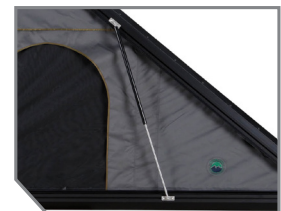
NITROGEN GAS CHARGED STRUTS