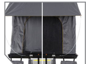
120G BREATHABLE MESH WINDOW SCREENS