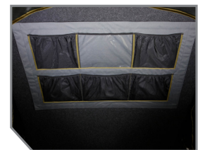
6 OVERHEAD INTERNAL STORAGE OPTIONS