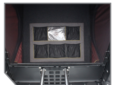
TRUCK BED ENTRY POINT