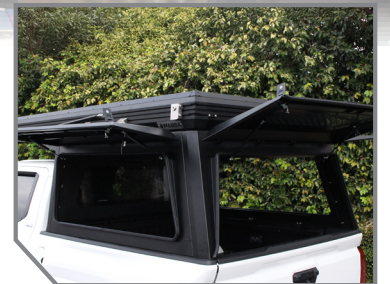
FULL GULWING SIDE DOORS