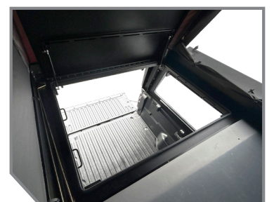
RETRACTABLE SLEEPING AREA