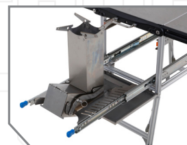
WOOD/CHARCOAL BURNER FOR NON-PROPANE COOKING