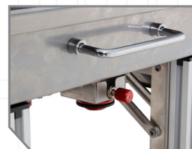
2 FUEL THROTTLES FOR TEMPERATURE CONTROL