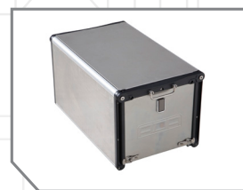
CLOSED DIMENSIONS 23 1/2" X 14 1/2" X 13"