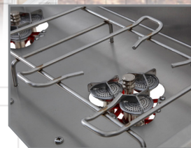
DUAL PROPANE BURNERS THAT WORK WITH SKILLET