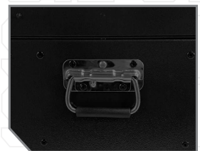
HEAVY DUTY HANDLES WITH PLASTIC GRIPS