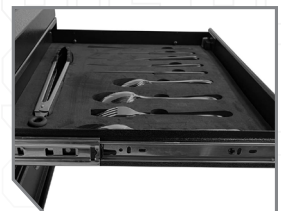
FOAM INSERTS TO SECURE AND ORGANIZE UTENSILS