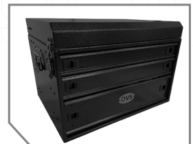
CLOSED DIMENSIONS 22" X 15" X 14.4"