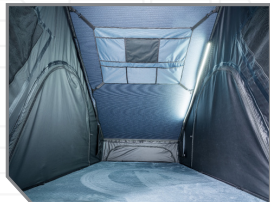
BLACK OUT INTERIOR COAT BLOCKS LIGHT INTRUSION