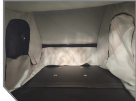
COLD WEATHER INSULATION KIT