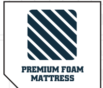
PREMIUM FOAM MATTRESS