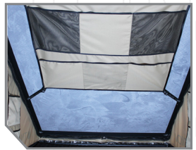
OVERHEAD AND SIDE STORAGE OPTIONS