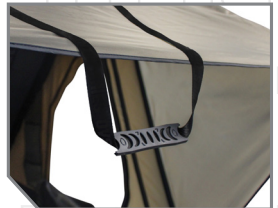
HEAVY-DUTY NYLON PULL STRAP WITH GRAB HANDLE