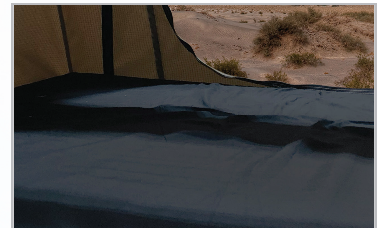
HIGH DENSITY MATTRESS WITH COVER