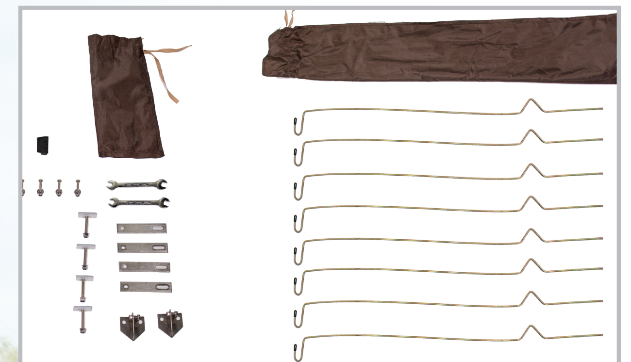
ALL HARDWARE INCLUDED WITH PURCHASE