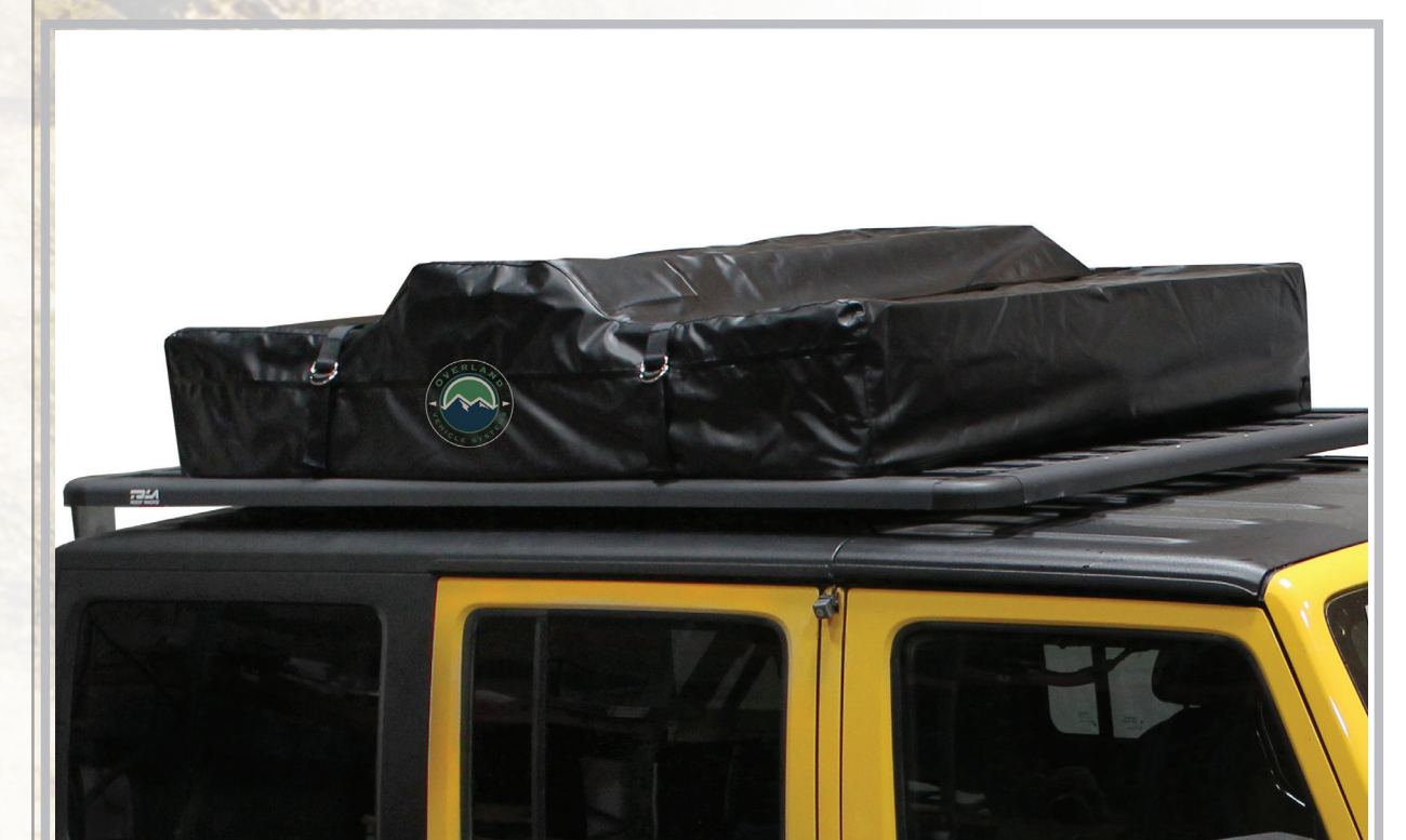
BLACK PVC TRAVEL TENT COVER