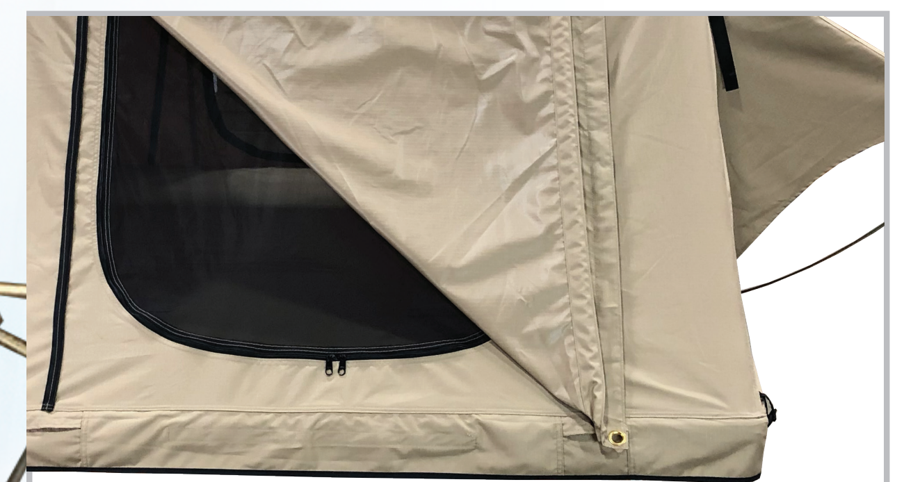
MULTIPLE TIE DOWN POINTS FOR ALL WINDOWS