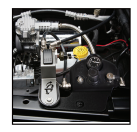
Part # 269-0717 GEN 2 Jeep Jk 4 Tire Inflation System On Board ADS Rear Engine Controller Box