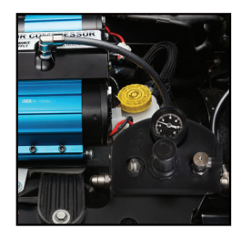
Part # 218-2819 GEN 2 Jeep JL 4 Tire Inflation System On Board ADS Engine Mount Controller Box.