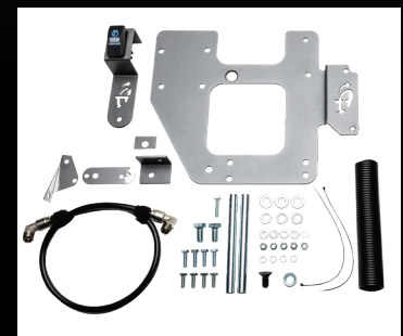
22-7810 Jeep<sup>®</sup> JK ARB<sup>®</sup> CKMTA12 Engine Mount Install Bracket Kit