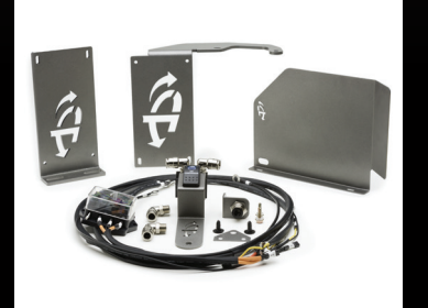
22-2719 Jeep<sup>®</sup> JK Twin Viair<sup>®</sup> Engine Mount Install Bracket Kit. Designed to work with 2 Viair<sup>®</sup> 400c or 440 Compressors

22-1819 Jeep® JL ARB® CKMTA12 SkidPlate Mounting Install Kit.