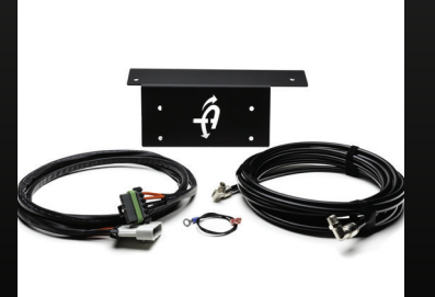
69-1819 Jeep<sup>®</sup> JK & JL ARB® CKMTA12 Cargo Mount Install Bracket Kit.