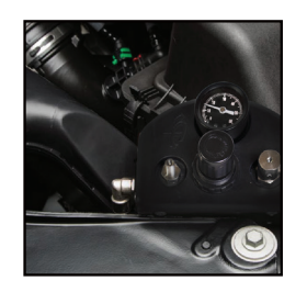
Part # 220-0118 GEN 2 Ford Raptor 4 Tire Inflation System On Board Engine Mounted ADS Controller Box.