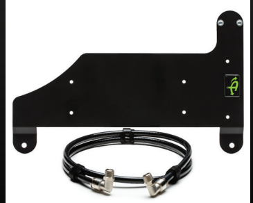
44-1819 Jeep<sup>®</sup> JL 4 Door ARB<sup>®</sup> CKMTA12 Under the Seat Install Bracket Kit