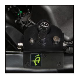
Part# 288-9999 GEN 2 Universal Bracket 4 Tire Inflation System On Board ADS Controller Box