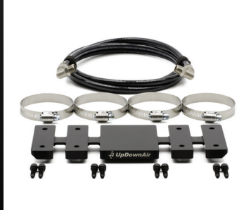
ARB TUB-2000 UTV ARB® Compressor Tube Bracket System

44-0717 J eep<sup>®</sup> JK 4 Door ARB<sup>®</sup> CKMTA12 Under the Seat Install Bracket Kit