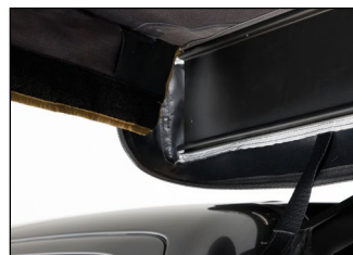
HEAVY-DUTY ONE PIECE ALUMINUM FRAMES