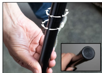
TWIST AND LOCK TECHNOLOGY