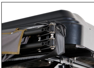
DUAL PIVOT POINT